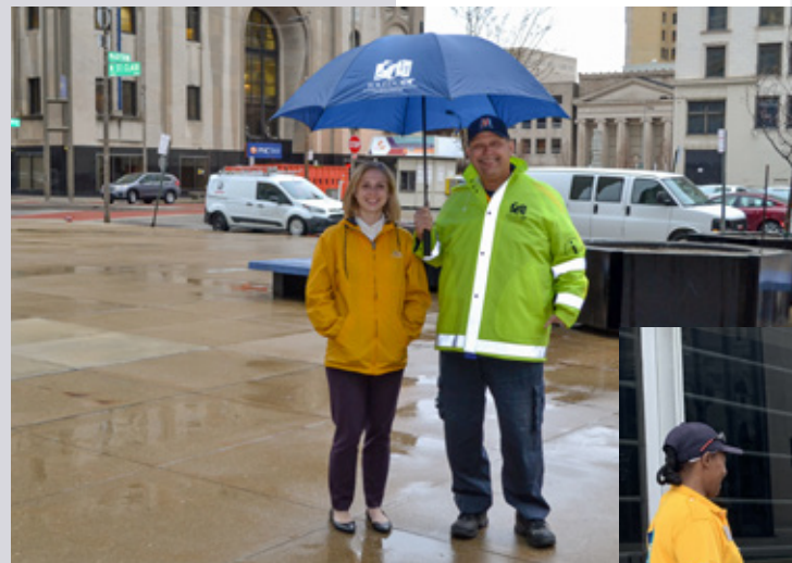
Ambassadors assist with umbrella escorts and also provide water in unseasonably hot weather